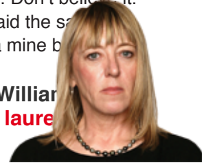
Jody Williams Nobel laureate

“Governments say a nuclear weapons ban is unlikely. Don’t believe it. They said the same about a mine ban.”